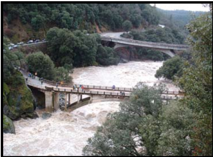
2005 - Raging South Yuba River at HWY 49