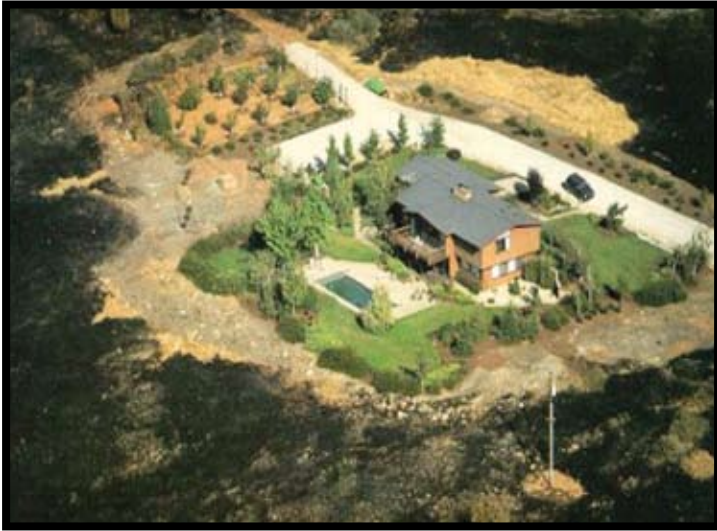
1988 49er Fire - Good Defensible Space