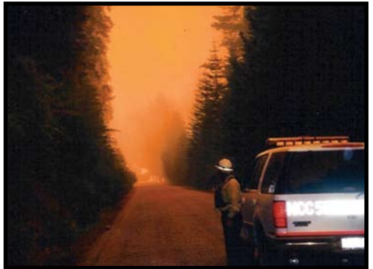
2001 Star Fire Overrunning Road