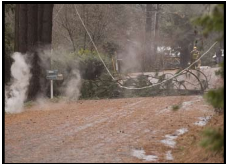
2007 - Arcing Power Lines w/Tree Blocking Road