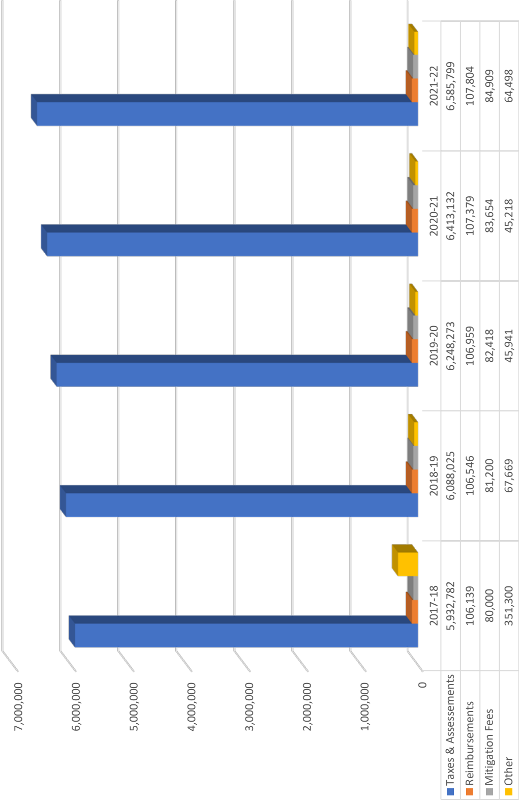
Five Year Revenue Projection - 3% Scenario

Property Taxes & Assessment - 3% increase each year. Special Tax - 1.5% increase each year. Other - Property sales, interest, permits, rentals.